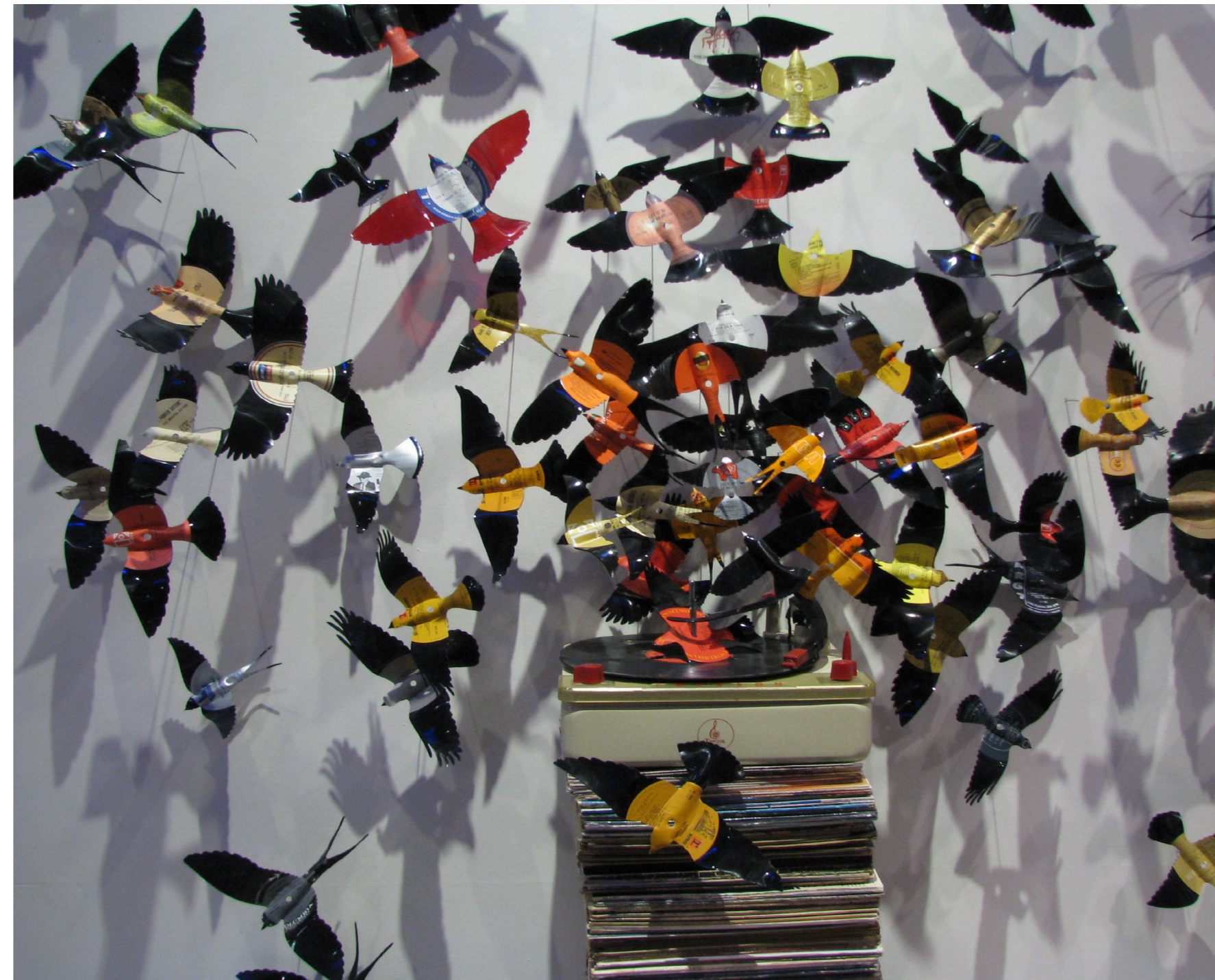
Paul Villinski via Flickr

Becoming more diverse as development organisations will require a concerted effort of the sector as a whole. Yet, this effort should not be seen as a burden. Diversification, inclusion, working closely with the wide variety of diaspora groups – it is not a burden, it is a huge opportunity. It will provide joy, creativity and much needed credibility. ■