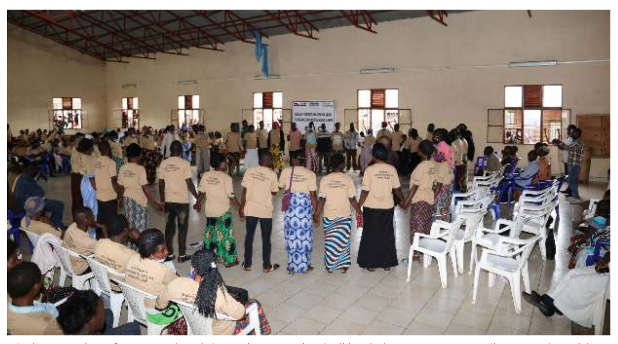
Closing meeting of Community Dialogue in a meeting hall in Kitshanga.